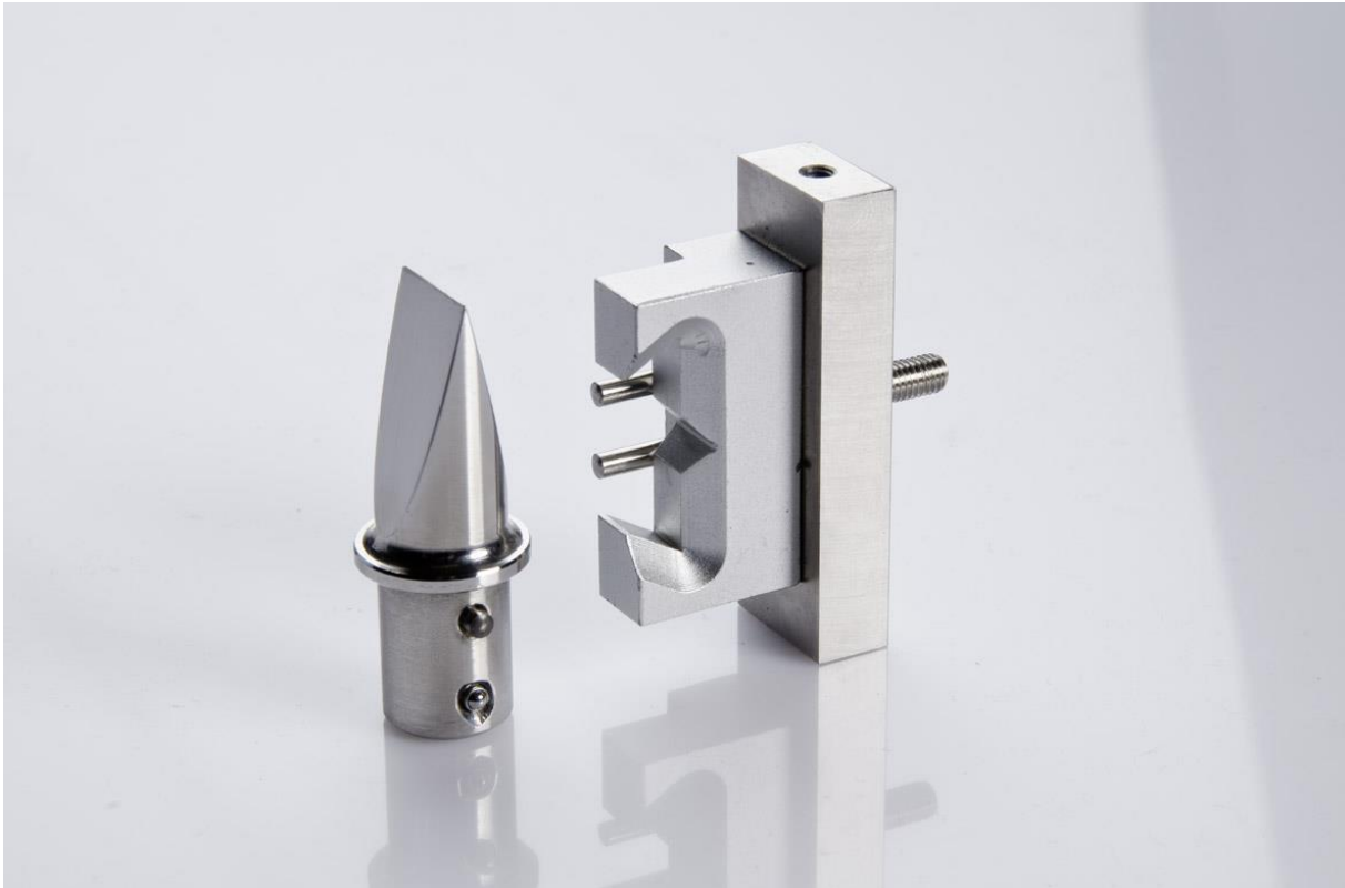
Tension Strength Test Set to test tablets having a break-line (29-28550/52/53/55)