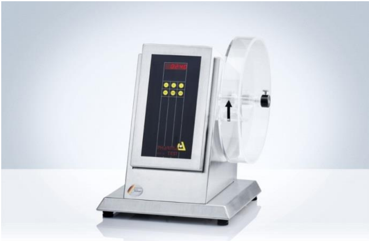
PTF 10E single-drum Tablet Friability Test Instrument

The PTF 10E single-drum tablet friability test Instrument with fixed speed is manufactured in compliance to the USP <1216>, EP <2.9.7> and other Pharmacopoeias. This version is available as single or dual drum instruments.