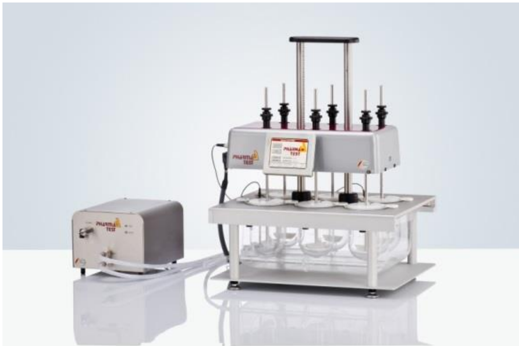
PTWS 120S 6-position Dissolution Tester

The PTWS 120S is a 6 position, multiple drive, compact tablet dissolution testing instrument for solid dosage forms as described in USP chapter <711/724> and EP section <2.9.3/4> as well as the BP, DAB and Japanese Pharmacopeia section <15>. It is designed for manual operation and ease of use.